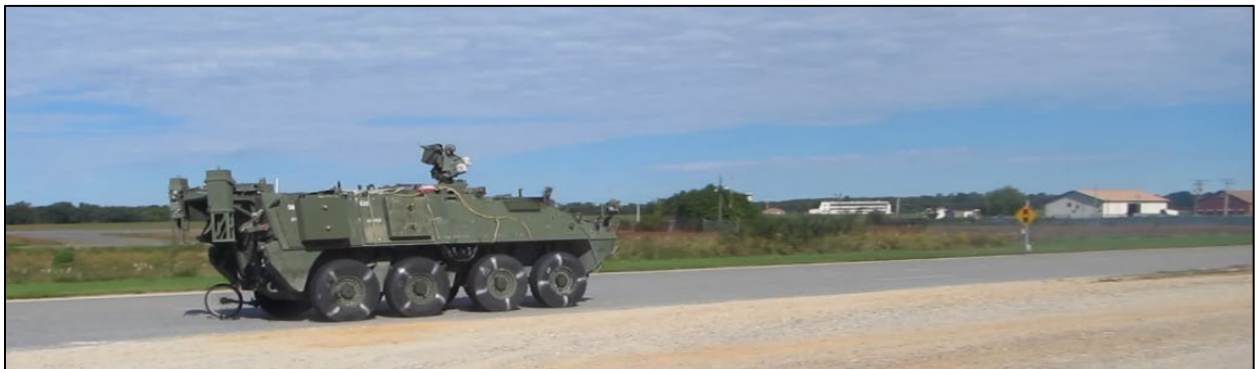
The Stryker DVH A0 on the ATC test track during spherical brake FMVSS121.

SBD conducted the demonstration toward the end of Federal Motor Vehicle Safety Standards 121 stopping distance testing, which was performed concurrently on both vehicles. In January 2023, the MTV and Stryker completed all track testing, hill hold evaluation, and structural integrity. The project is transitioning to the Marine Corps Systems Command (MCSC) in April 2023 for the execution of Reliability Qualification Testing (RQT) on the Amphibious Combat Vehicle (ACV) through Program Manager Advanced Amphibious Assault (PM AAA). This effort represents a strategic, combined joint effort across department agencies to bring novel innovative technologies to the Warfighter.